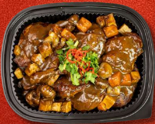
FORTUNE BLACK GARLIC-BRAISED DUCK LEG WITH BLACK GARLIC DEMI-GLACE