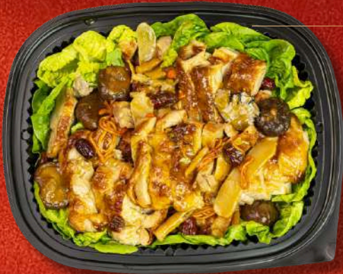
GOLDEN ROAST CHICKEN THIGH WITH CORDYCEPS & ANGELICA ROOT