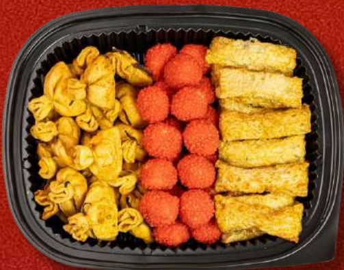
PROSPERITY CRISPY FEAST PLATTER

(lychee prawn balls, traditional ngoh hiang, crispy chicken money bags, lao gan ma aioli)