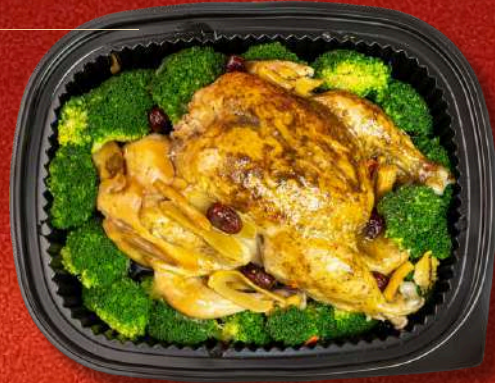
EMPEROR HERBAL STEAMED KAMPONG WHOLE CHICKEN