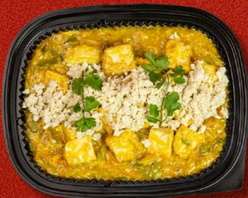
GOLDEN PUMPKIN BRAISED TOFU WITH LEEK AND CRAB MEAT