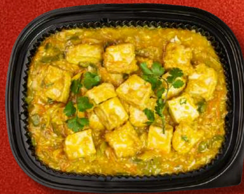
GOLDEN PUMPKIN BRAISED TOFU WITH LEEK