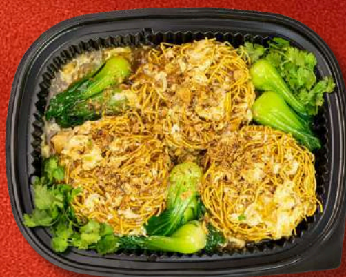
SILKEN EGG DROP CRISPY NOODLES