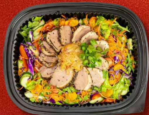
CRYSTAL JELLYFISH & SMOKED DUCK TANGERINE SALAD