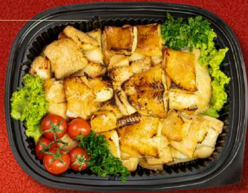
UMAMI OVEN-BAKED HALIBUT WITH MISO GLAZE