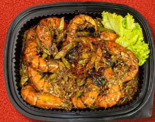
PROSPERITY XO WOK-FRIED TIGER PRAWN WITH BLACK FUNGUS & CELERY