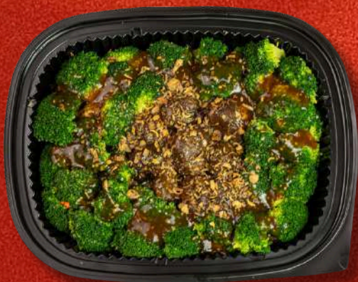
FRAGRANT SHIITAKE, BROCCOLI AND CARROT IN SUPERIOR BROTH