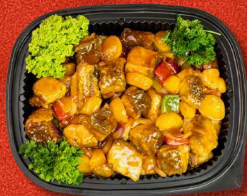
KUMQUAT PINEAPPLE SWEET & SOUR DEEP-FRIED BARRAMUNDI