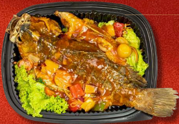
AUSPICIOUS DEEP FRIED WHOLE SEABASS IN KUMQUAT PINEAPPLE SWEET AND SOUR SAUCE