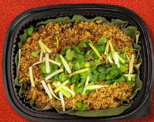
REUNION EIGHT-TREASURE JASMINE RICE