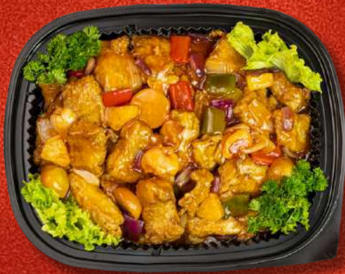
KUMQUAT PINEAPPLE SWEET & SOUR DEEP-FRIED PACIFIC FISH