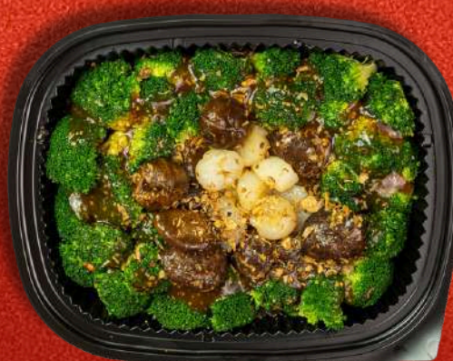
FRAGRANT WOK-FRIED BROCCOLI & SHIITAKE WITH SCALLOP